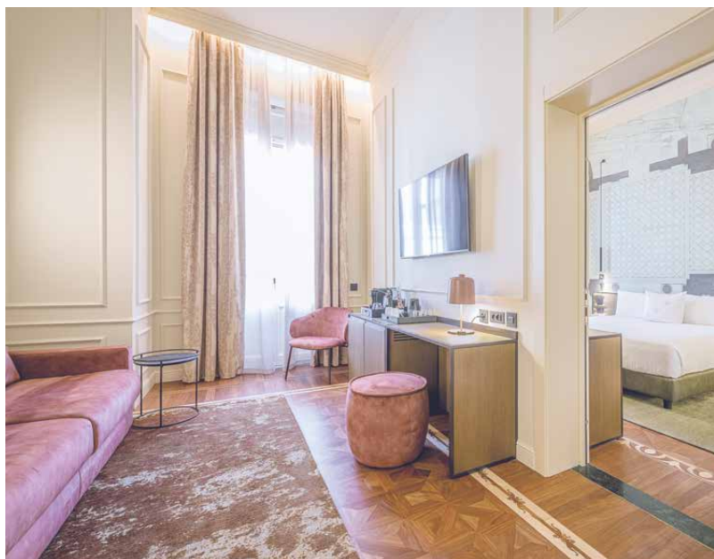
Junior Suite/Family Room

Junior Suite/Family Room —A separate sitting area offers additional comfort and flexibility, perfect for relaxing together after a day in Florence. All Junior suite also feature a comfortable sofa bed, providing privacy and outstanding functionality for families and friends.