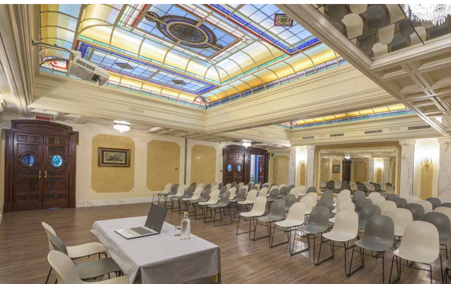
Concordia Meeting Room