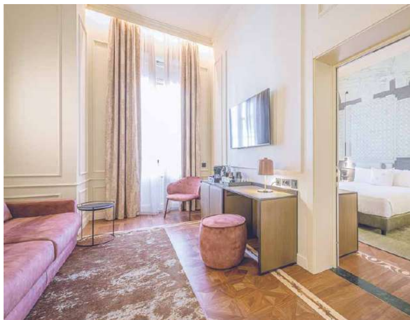
Junior Suite/Family Room

Junior Suite/Family Room —A separate sitting area offers additional comfort and flexibility, perfect for relaxing together after a day in Florence. All Junior suite also feature a comfortable sofa bed, providing privacy and outstanding functionality for families and friends.