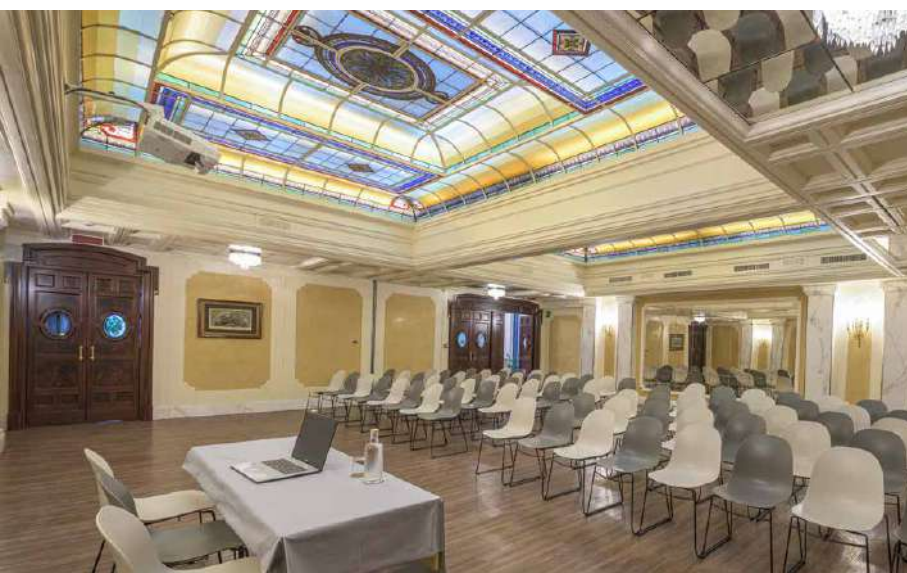
Concordia Meeting Room