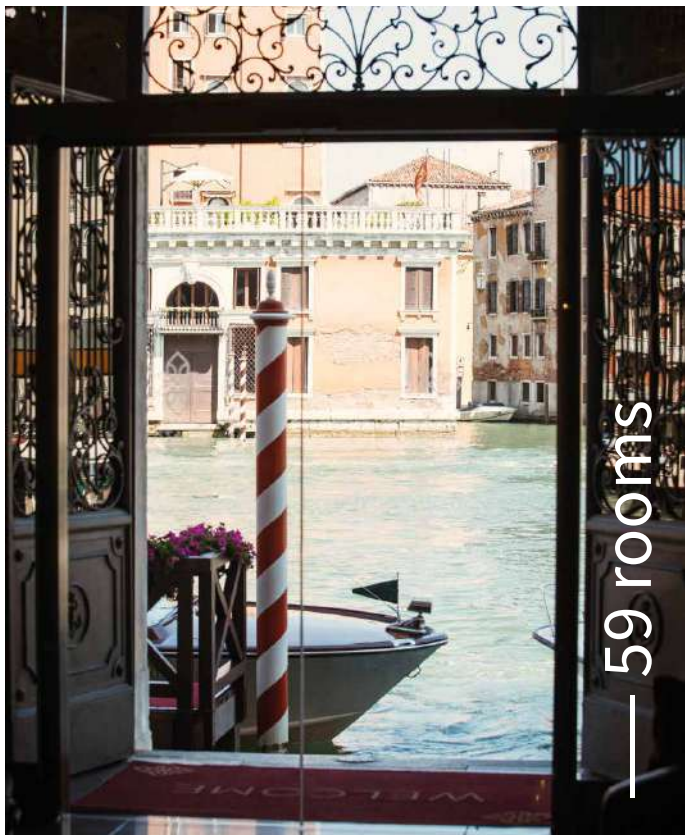
View from the Lobby

Boutique and Premium Rooms —Our Boutique and Premium rooms overlook either the intimate courtyard or Venice's charming alleys, giving guests the true taste of the authentic spirit of the city.