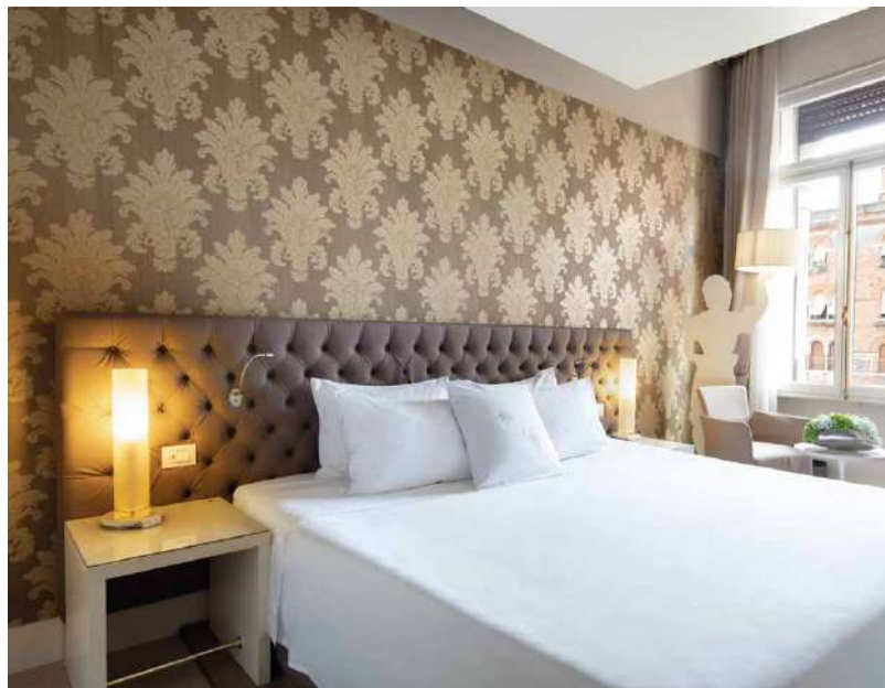
Boutique and Premium Rooms