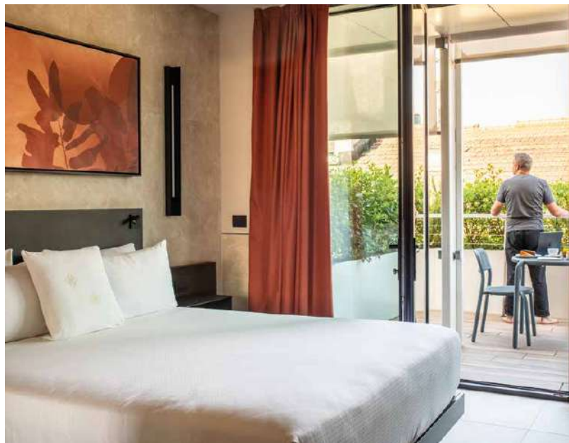
Room with Terrace

Room with Terrace —Step out onto your spacious private terrace and experience Milan from a new perspective. These rooms combine contemporary cosiness with the charm of open-air living, ideal for relaxing moments at any time of day.